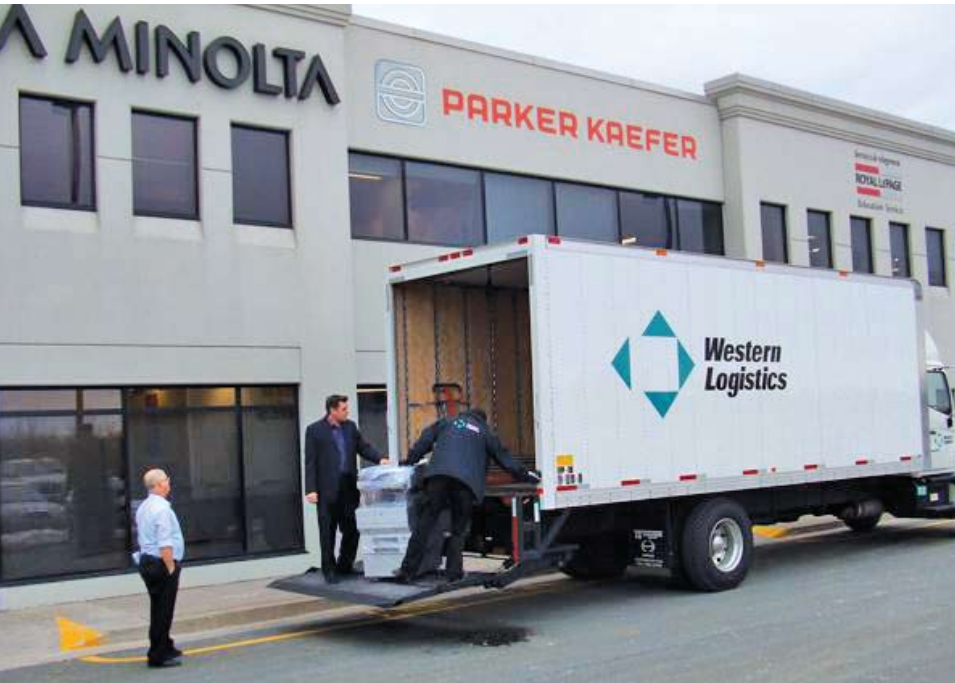
The very first movement of imaging technology in Dartmouth, NS, December, 2007

When Western Logistics opened its Dartmouth Terminal in October, 2007, to serve the office furniture industry, it also established a regional delivery service for business electronics, primarily the high-tech scanner-copiers which are fast becoming de rigeur in most business offices.