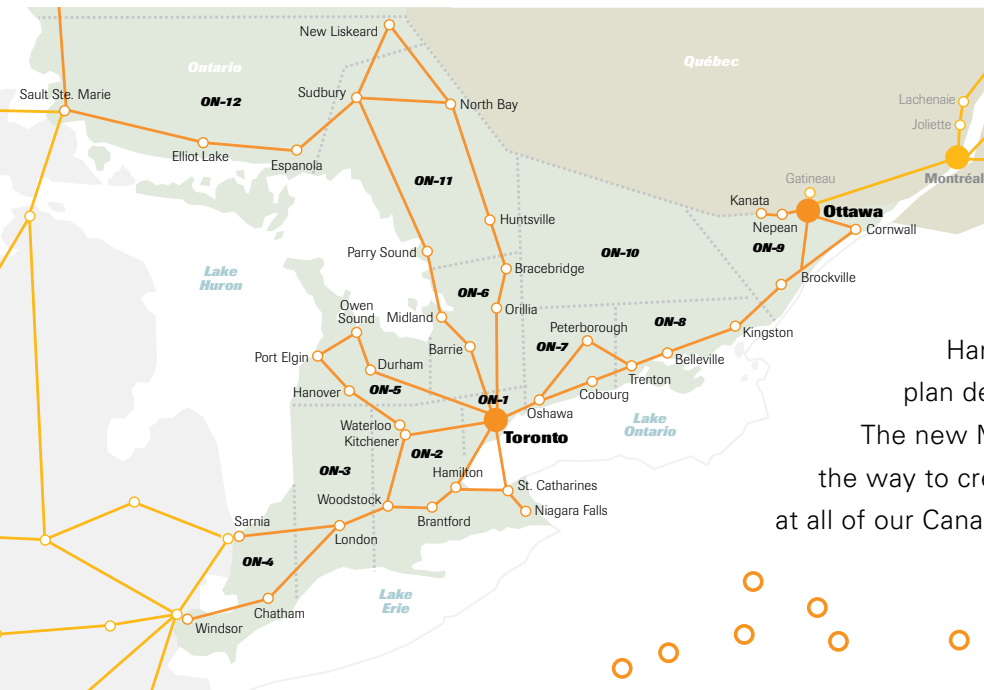
Zones ON-13 and ON-14 are in NW Ontario

The new Mississauga facility is one more step along the way to creating a network of company-designed DC's at all of our Canadian and American service areas by 2015."